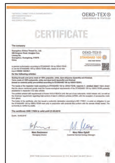
Oeko-Tex Standard 100 HKB 17829 Testex

我們還制定了目標和質量的可靠性。實踐一貫的原材料質量控制，鼓勵認真工作及保持於良好工作狀態下的生產設備。