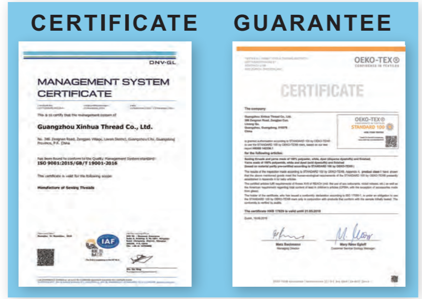
ISO 9001:2015/GB/T 19001-2016